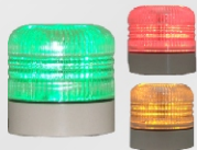
52mm Red/Yellow/Green L.E.D.

The LD-2648-700 offers 360 degree viewing angle, as well as, viewable from above (top view). This beacon is versatile in industrial and non-industrial environments.